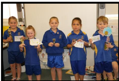
Stars of the Week