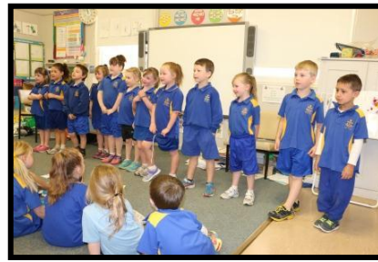
2H reading a story