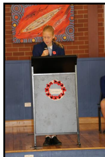
Narrandera Public School students conducted a Remembrance Day Assembly to recognise our fallen heroes.