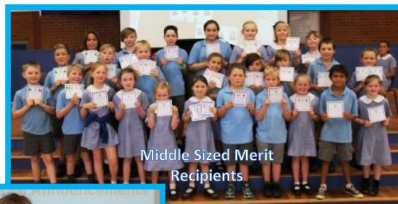
Middle Sized Merit Recipients