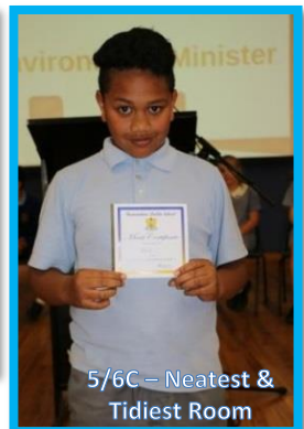
5/6C – Neatest & Tidiest Room