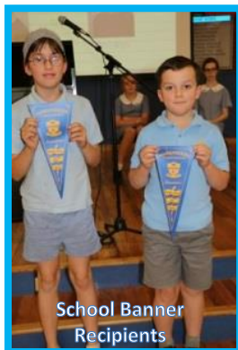
School Banner Recipients