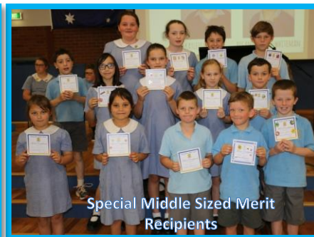
Special Middle Sized Merit Recipients