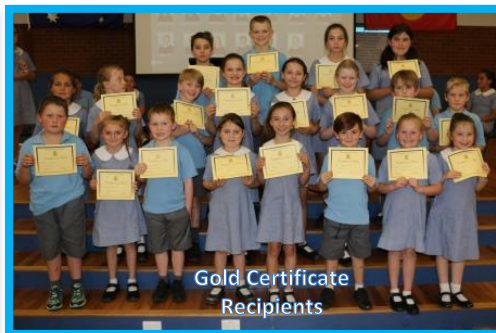
Gold Certificate Recipients