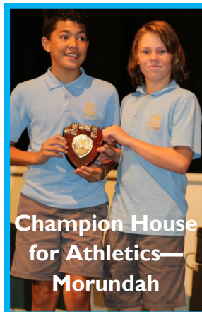
Champion House for Athletics— Morundah