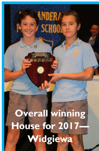
Overall winning House for 2017— Widgiewa