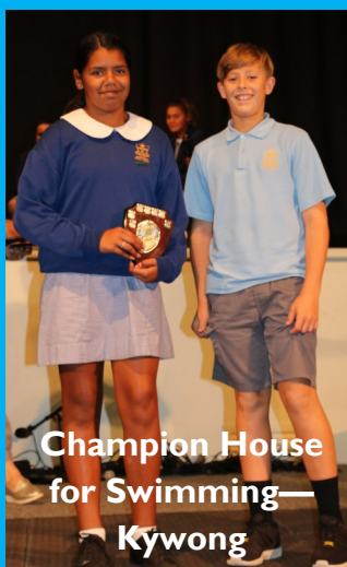
Champion House for Swimming— Kywong