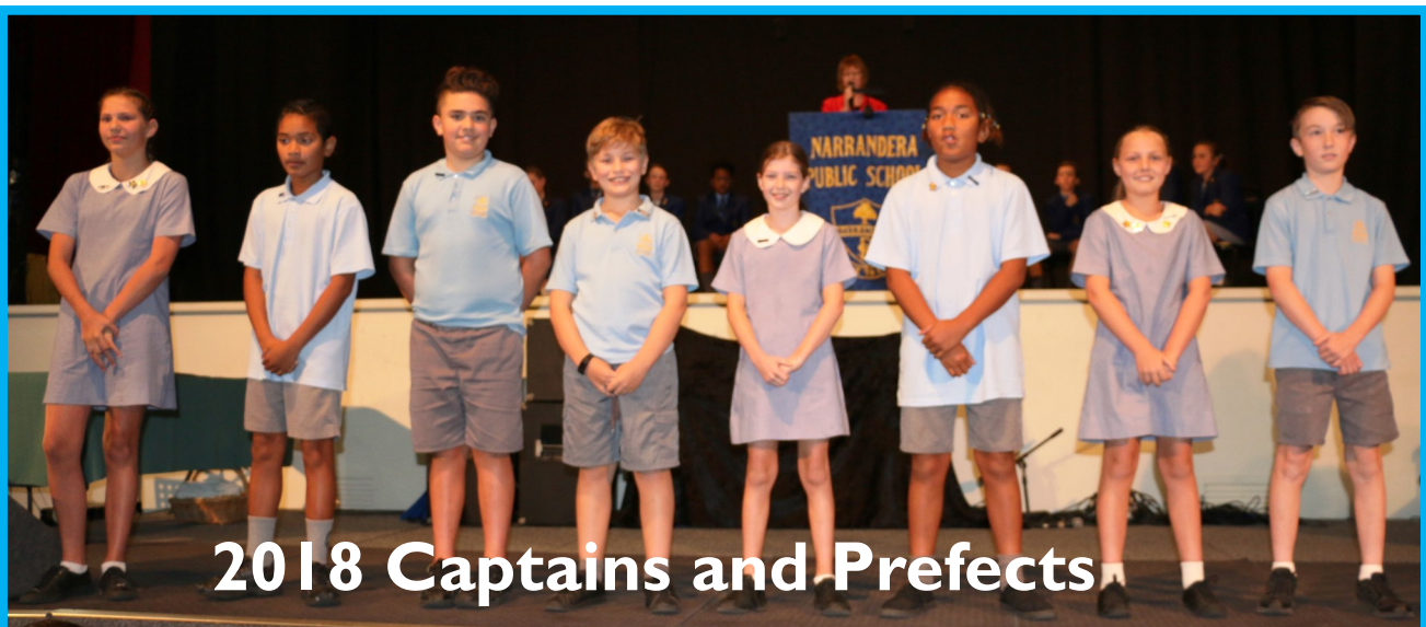
2018 Captains and Prefects