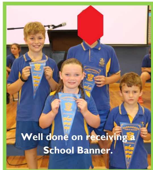
Well done on receiving a School Banner.