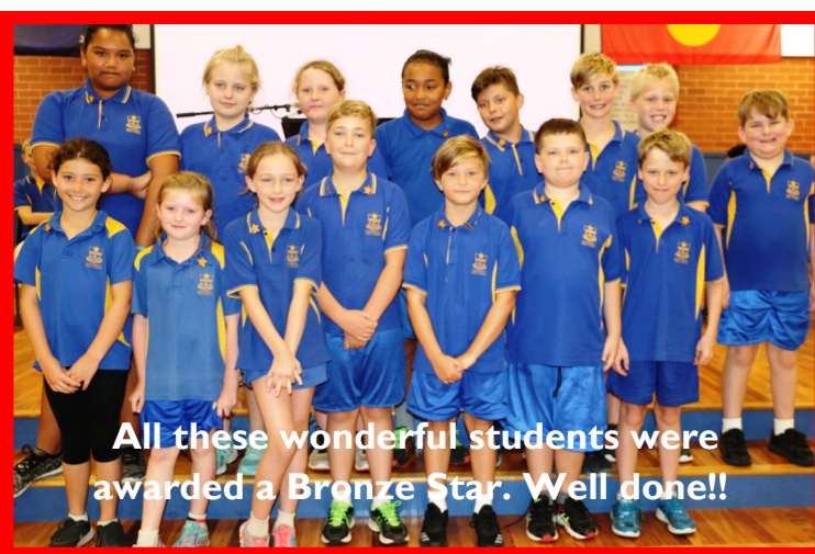
All these wonderful students were awarded a Bronze Star. Well done!!