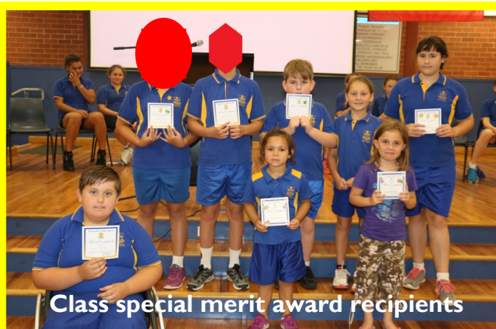
Class special merit award recipients