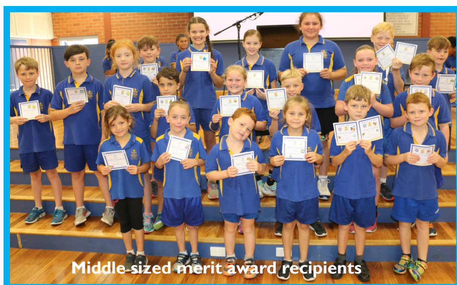
Middle-sized merit award recipients