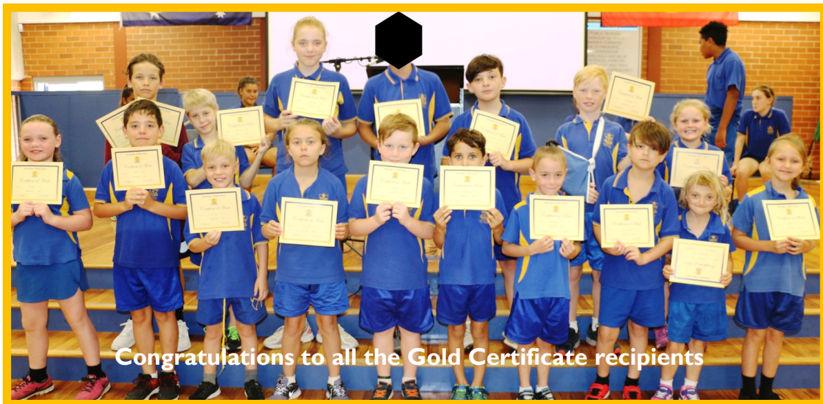
Congratulations to all the Gold Certificate recipients