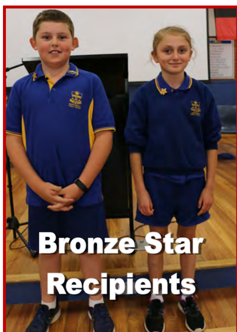
Bronze Star Recipients