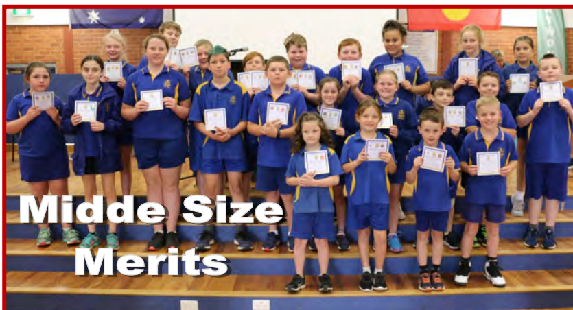
Middle Size Merits