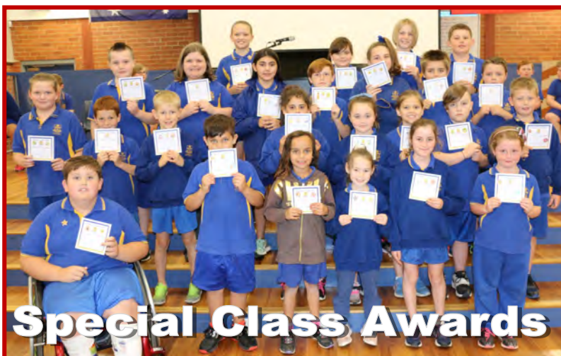
Special Class Awards