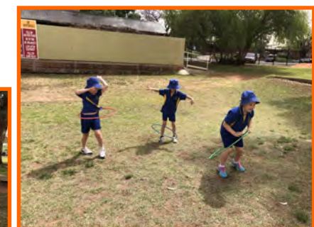
KN doing some fun tabloid skill based sport activities