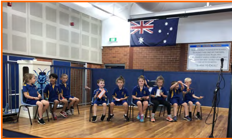
KN ready to run assembly on Friday.