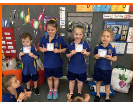
KN award winners for last week