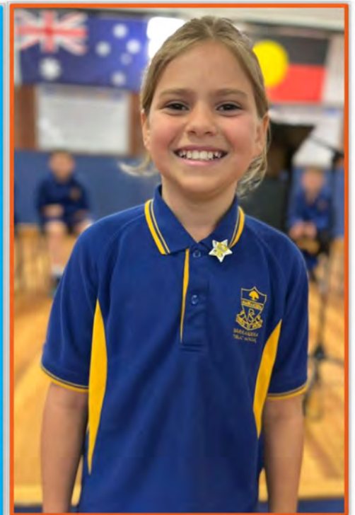
Gypsy Silver Star Recipient