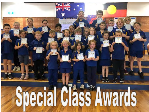
Special Class Awards