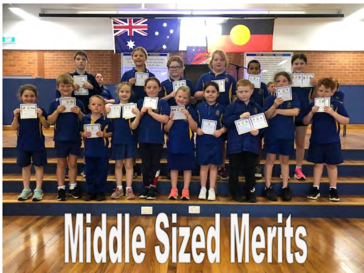
Middle Sized Merits