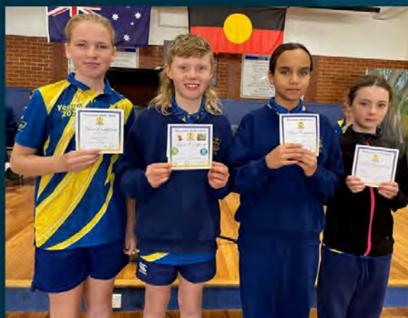
MIDDLE SIZED MERIT