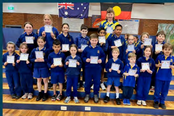
CLASS SPECIAL AWARDS