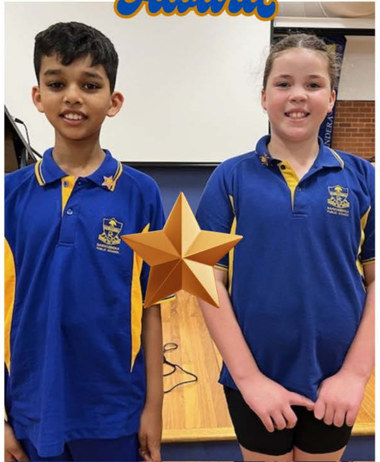
Bronze Star Award