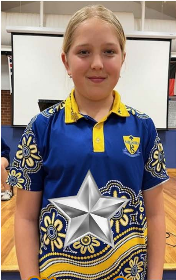
Silver Star Award