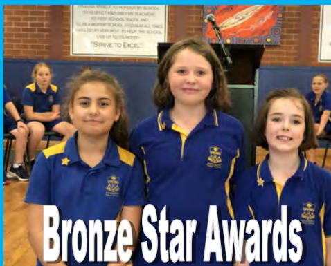
Bronze Star Awards