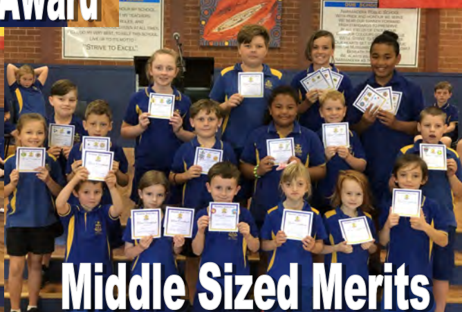
Middle Sized Merits