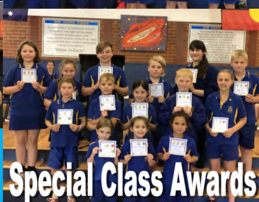
Special Class Awards